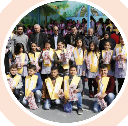
honoring UNRWA schools