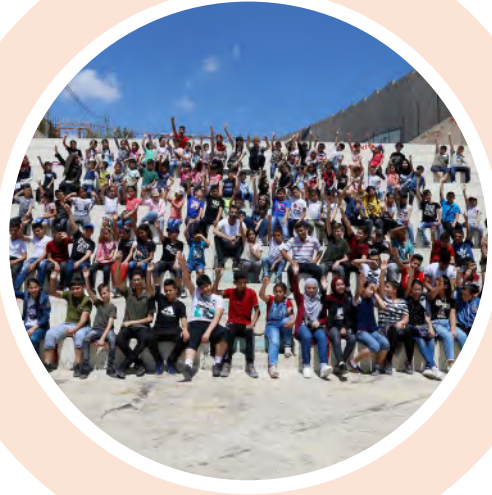
“we will return” summer camp launch, celebrating 21 years of Alrowwad