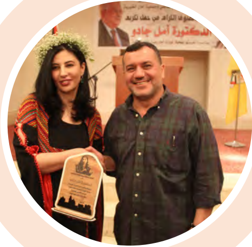
honoring Amal Jado, the Deputy Foreign Minister