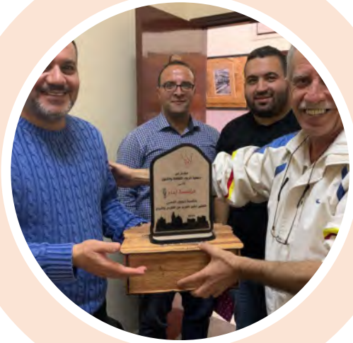
twinning with nogent-sur-oise municipality Municipality celebration