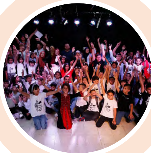
Alrowwad's summer camps conclusion events