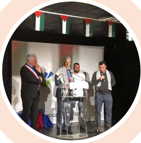
honoring Ibdaa' Society