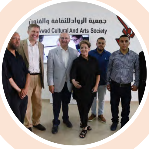
“we cultivate hope” photo exhibition