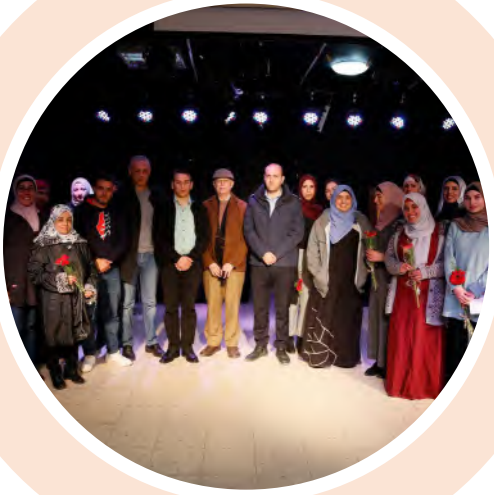
“say no to drugs” campaign conclusion