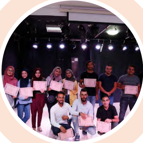
2019 photography sessions conclusion