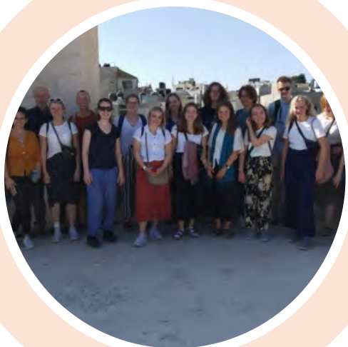
Friends of Alrowwad visit from Norway