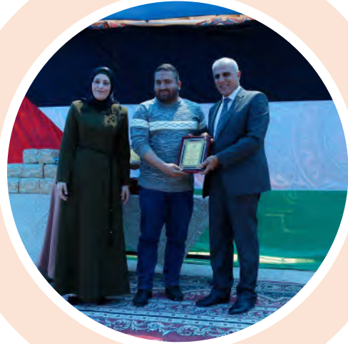
best School Radio award