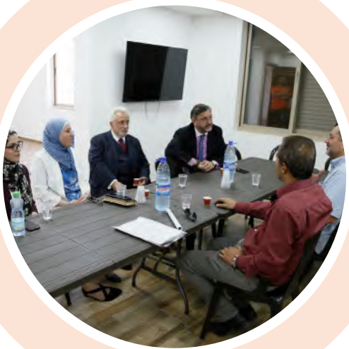
a delegation from Croatia visited Alrowwad. The delegation included the Croatian Minister of Foreign and European Affairs, Veez Skrasis. And the Non-resident Ambassador, Tomeslav Boshniac.