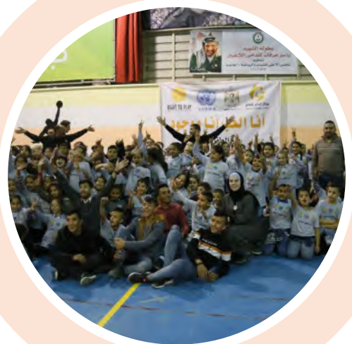
"Learn" project 2019 conclusion